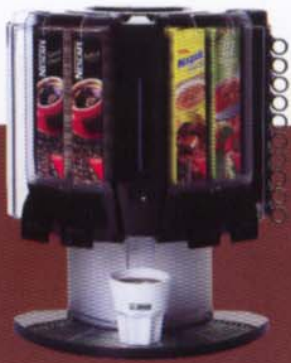
1. Art. no. 2080 = Jede Xpress machine, dispenser x 2