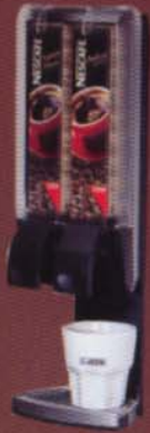
2. Art. no. 3322 = JM, dispenser x 2 (wall bracket art no. 3325, see below)