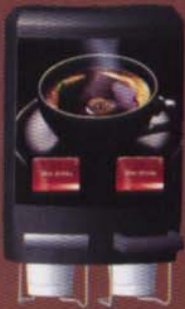
3. Art. no. 3323 = HC, dispenser x 2