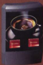
4. Art. no. 3324 = Frantass dispenser x 2